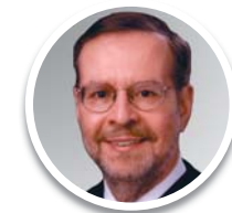
Honorable Arthur J. Schwab FROM THE U.S. DISTRICT COURT FOR THE WESTERN DISTRICT OF PA