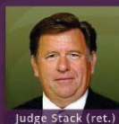
Judge Stack (ret.)