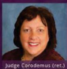
Judge Corodemus (ret.)

COME WITH QUESTIONS . LEAVE WITH ANSWERS . GROW YOUR PRACTICE .